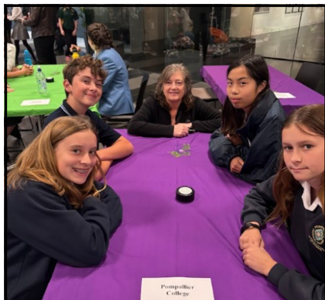
National Kids Lit Quiz, Wellington