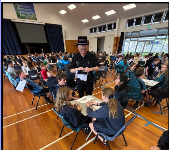
Regional Kids Lit Quiz, Kerikeri