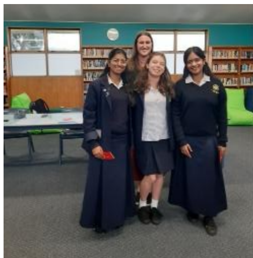
Senior Category Winners (L-R):