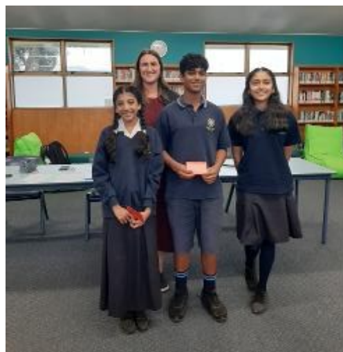
Junior Category Winners (L-R):